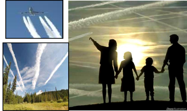
The fragile balance of nature is adversely affected by this dangerous spray program!