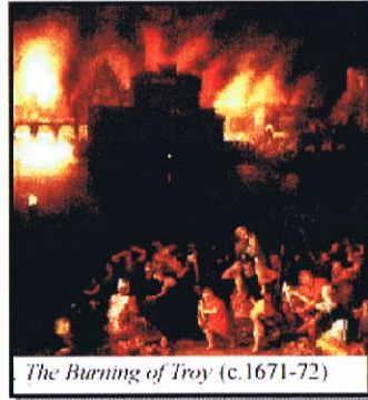
The Burning of Troy (c.1671-72)

The Trojan Horse was a huge, hollow, wooden horse constructed by the Greeks to gain entrance into the city of Troy during the Trojan War in the 12th cent. BCE.