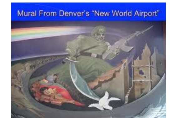
Depiction of America's defeat on display in Denver!