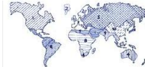
The Regionalization of the World System – 1910 The Club of Rome

This will be rebellious man's final attempt at world government, but after its short reign, the Second Coming of Yahweh's Anointed One – Yahsha the Meshiakh will crush this New World Order into the dustbin of history! (Daniel 2:45; Rev.19:15) The war known as ' Armageddon ' (Rev.16:16) is the gathering of earth's remaining militaries against the returning Messiah of Israel! This does not take place until the "last trump" of the Seventh Seal (I Cor.15:52; Rev.19).